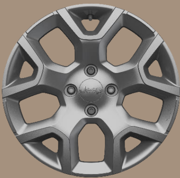
Altitude Standard Wheel 17" Full Painted Alloy