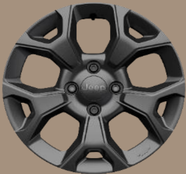
Longitude Standard Wheel 16" Painted Alloy