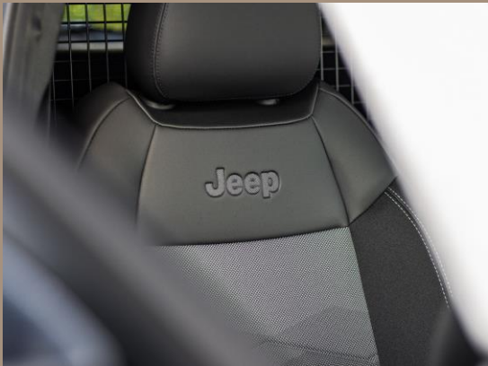
Standard Upholstery Robin Cloth / Vinyl with Grey Accents